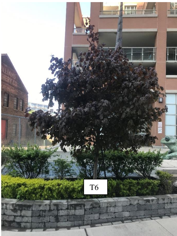
Photo 6: Northeast corner limit of 86 Lynn Williams St. property (facing west)